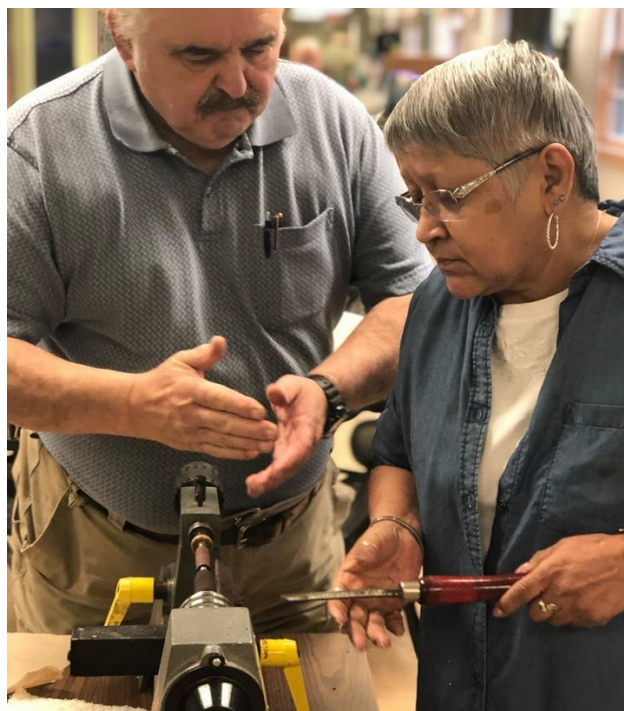
Participants learn the fine art of woodworking and how to use the many tools in our woodshop.