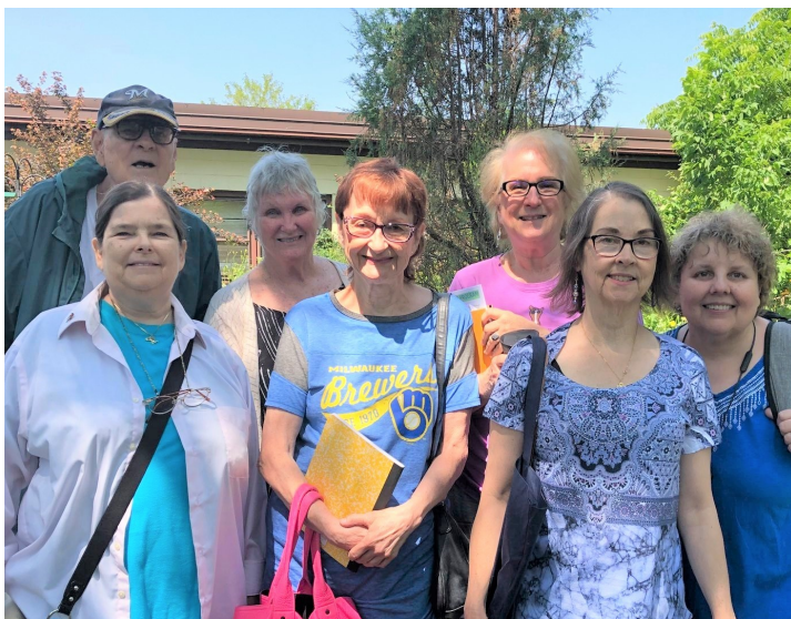
Writing Club members meet weekly to fine tune their creative writing skills.

204 volunteers provided 31,060 hours of service helping with meals, administrative tasks, and teaching classes.