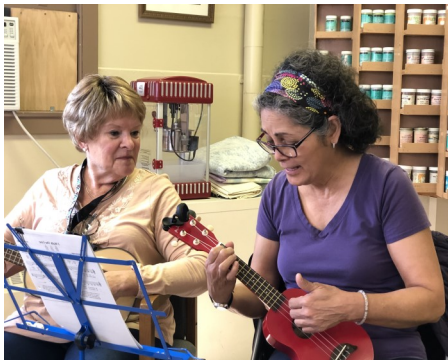
Ukulele lessons bring participants together to share their love of music.

Research shows that compared with their peers, senior center participants have higher levels of health, social interaction, and life satisfaction. 1