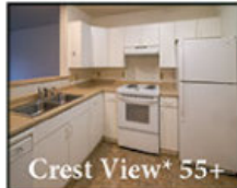
Crest View* 55+