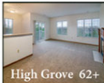
High Grove 62+

One & two bedroom apartment homes For a tour, please call 414-541-3333