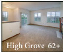
High Grove 62+

One & two bedroom apartment homes For a tour, please call 414-541-3333