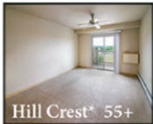
Hill Crest* 55+

Independent Senior Communities close to shopping & entertainment, with 24-hour emergency maintenance, heat included* & weekly shopping bus!