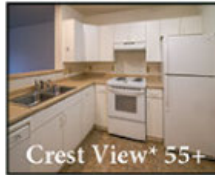
Crest View* 55+