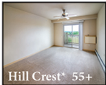
Hill Crest* 55+

Independent Senior Communities close to shopping & entertainment, with 24-hour emergency maintenance, heat included* & weekly shopping bus!