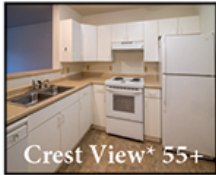
Crest View* 55+