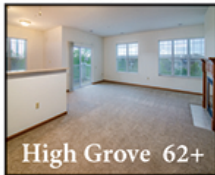
High Grove 62+

One & two bedroom apartment homes For a tour, please call 414-541-3333